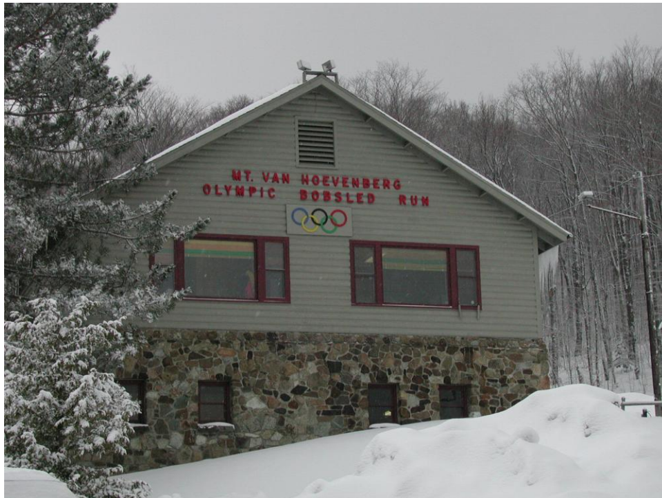
Front View of the Sled House. Club sliders enter on the back side.

When you arrive to slide (an hour or more before the scheduled session time, remember?), you'll proceed up the hill to your left to the sled house. We meet in the sled room, access through the doors on the uphill side of the building – the side opposite the Olympic Rings.