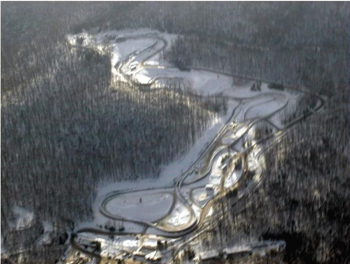
Aerial View of the Lake Placid Track

The information contained in here is only mean to orient and advise. You should follow the instructions of our USLA coaches or track workers at all times.